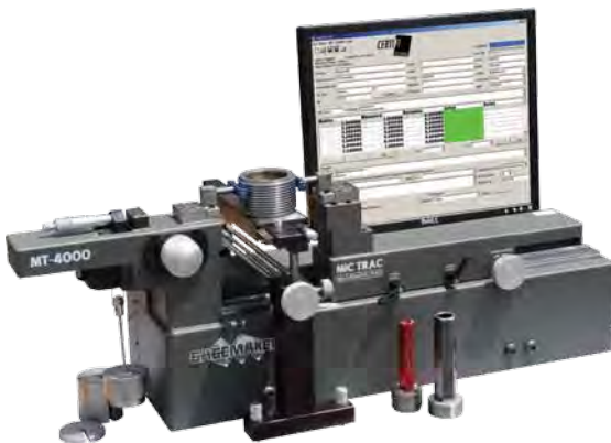
MIC TRAC 4000 In-House Precision Gage Calibration System