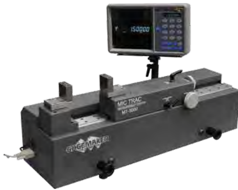
MIC TRAC 3000 Shop Floor Gage Setting and Part Measurement System